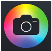
Photo circle is the safe and easy way that we share pictures of school with you! You can check the app daily for updated photos of your child having a blast at Learning Tree!

Download the photocircle app onto your smartphone then ASK GINGER or YOUR TEACHER FOR THE CODE!