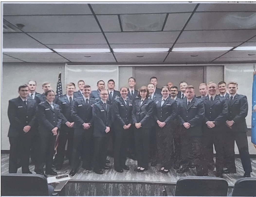
Thank you to the church for providing encouragement to Vance Air Force Class 24-11.