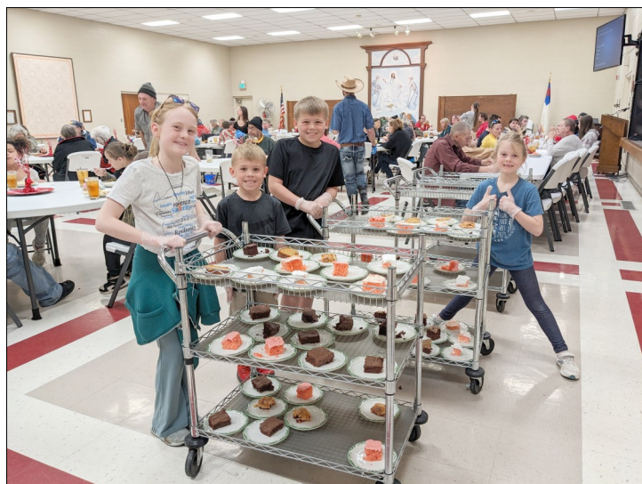
ABOVE and BELOW: Welcome Table in 2024.