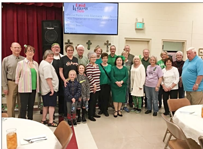
Welcome Table in 2019.