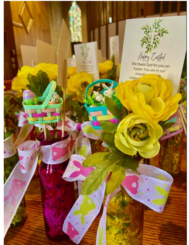
Easter appreciation gifts were delivered to members of the congregation living in retirement villages and nursing facilities on March 25 and 26.