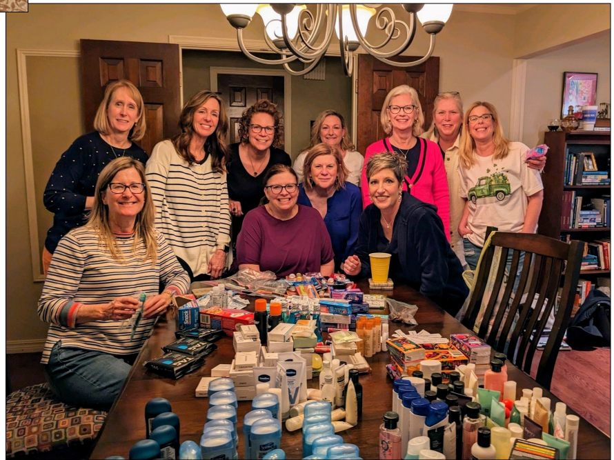
The women of Rahab Circle recently met to assemble 44 hygiene bags to go to Enid High and the middle schools for their March Mission project.